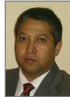
Founder & CEO