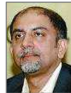
Co-Founder & Strategic Advisor

Nominated by Ernst & Young as 'Entrepreneur of the Year' in 2002